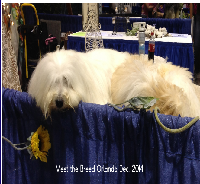
Meet the Breed Orlando Dec. 2014